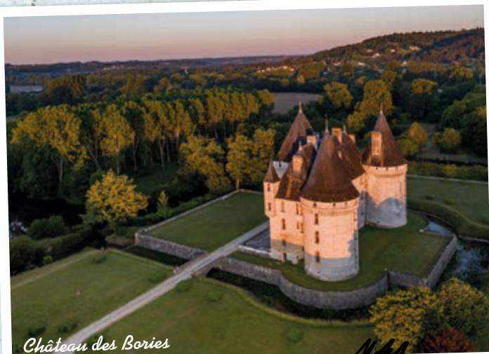
Château des Bories