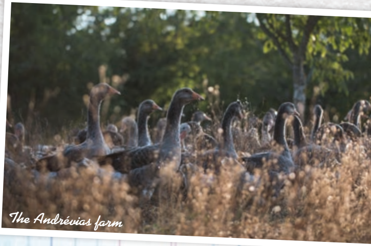
The Andrévias farm

Here the specialties are goose preparations, but there is also a walnuts grove of 10 hectares. The main goal of this farm is to maintain family know-how and traditions and to highlight the exceptional quality of goose foie gras.