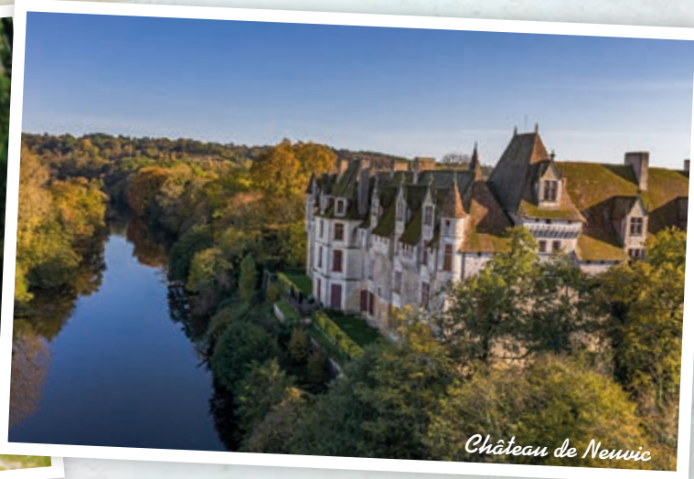
Château de Neuvic