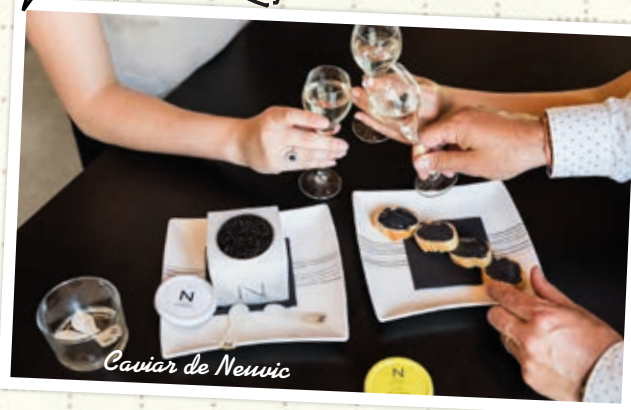
Caviar de Neuvic

A must see : for epicureans, the Caviar de Neuvic , invites you to discover the sturgeon. Discover the precise and precious gestures that allow the elaboration of caviar before a tasting! Several options for a visit are offered all year round upon reservation, to discover the caviar and the breeding farm.