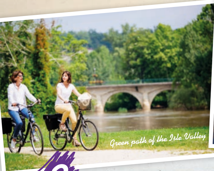
Green path of the Isle Valley