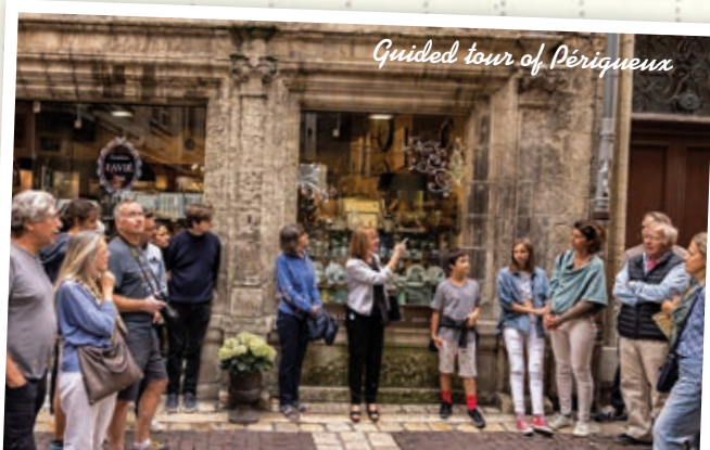
Guided tour of Périgueux

Périgueux was born in 1240 from the union of two geographically and politically opposed urban centers: the city of Petrocores to the west and the town of Puy Saint-Front to the east.