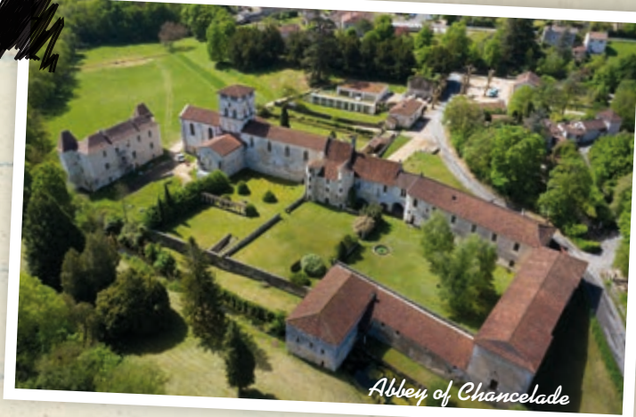
Abbey of Chancelade

Don't miss a detour to the Romanesque Abbey of Chancelade located in the village of the same name. It's construction was spread over the 10th to the 12th C. The abbatial church was listed an historic monument in 1909. It has suffered from the Hundred Years and Religious wars. We can still admire the 12th C. Romanesque chapel and the park of the Abbot House, with its famous painting: "Christ Mocked", attributed to painter Gerrit Van Honthorst and dating from the 17th C. Free Visit. Information at the Tourist Office of Grand Perigueux www.tourisme-grandperigueux.fr