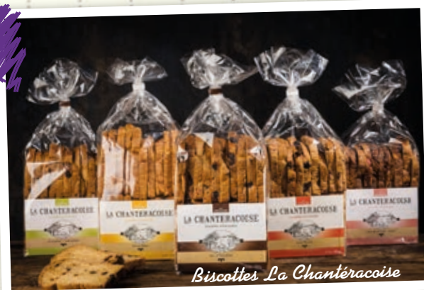
Biscottes La Chanteracoise

In the village of Saint-Germain du Salembre you find La Chanteracoise , the last traditional cookies factory in France. Here in the shop and workshop, you will learn about the history and how these delicious cookies are made.