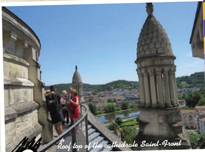
Roof top of the cathédrale Saint-Front