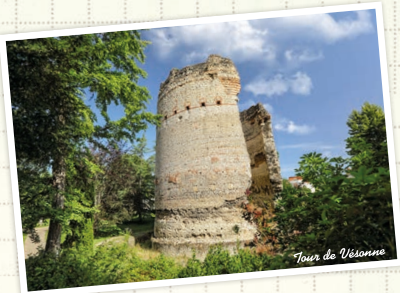
Tour de Vézonne

Accept to be guided and discover in a privileged way the history of Périgueux and urban walks.