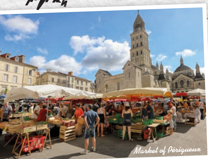
Market of Périgueux