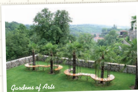
Gardens of Arts

The Gardens of Arts was designed and crafted in 2003 on the site of the former castle park in Nontron. This beautiful botanical garden is planted of Lebanon cedars, peonies from China, or maples from Japan. Discover about twenty terraces, arranged by exceptional artists and craftsmen, where different plant species mingle with artworks from various horizons.