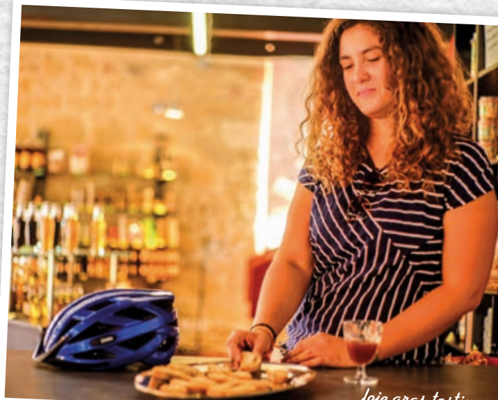
foie gras tasting

Head to the Regional Natural Park of Perigord-Limousin for a short walk of 2 km, very popular by locals, which leads to the so called “ Saut du Chalard ”, a charming waterfall in a beautiful natural site! The departure is from the hiking sign of the village of Champs Romain, but the end of the journey will be done walking!