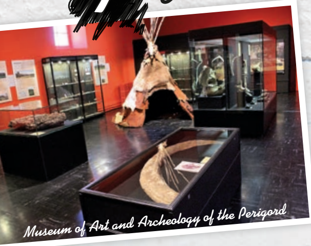
Museum of Art and Archeology of the Périgord