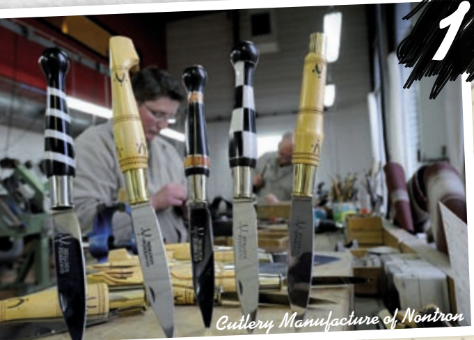
Cutlery Manufacture of Nontron