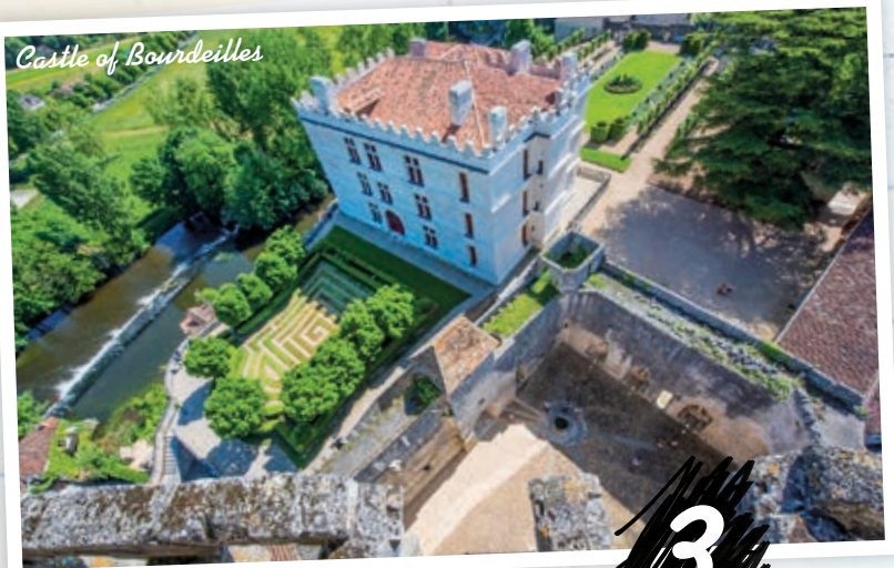
Castle of Bourdeilles

From Périgueux, head to the North, on D939. Château-l'Evêque , located at the top part of the village, is a castle with a keep built by the bishop Frotaire to protect the city of Périgueux from the Vikings coming the river up. Fortified in the 14th century, it was used after the Hundred Years War as a residence by the bishops of Périgueux to withdraw from political unrest. Today, it looks like a nice mix between Gothic and Renaissance Art. The present owner, Gérard de Colombières, is restoring the castle and opens part of it to the public as well as the gardens planted with 700 hydrangeas and multi-centenarians' yews.