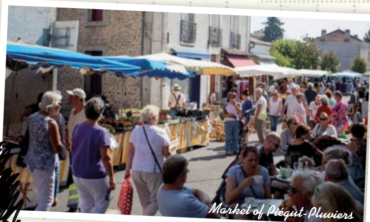
Market of Piégut-Pluviers