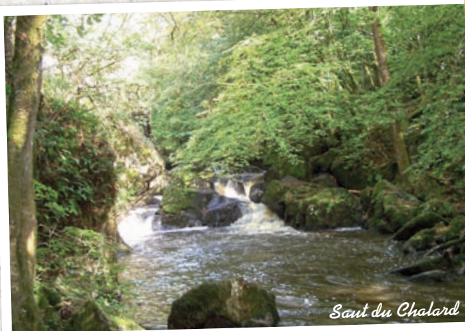
Saut du Chalard

Head to the Regional Natural Park of Perigord-Limousin for a short walk of 2 km, very popular by locals, which leads to the so called “ Saut du Chalard ”, a charming waterfall in a beautiful natural site! The departure is from the hiking sign of the village of Champs Romain, but the end of the journey will be done walking!