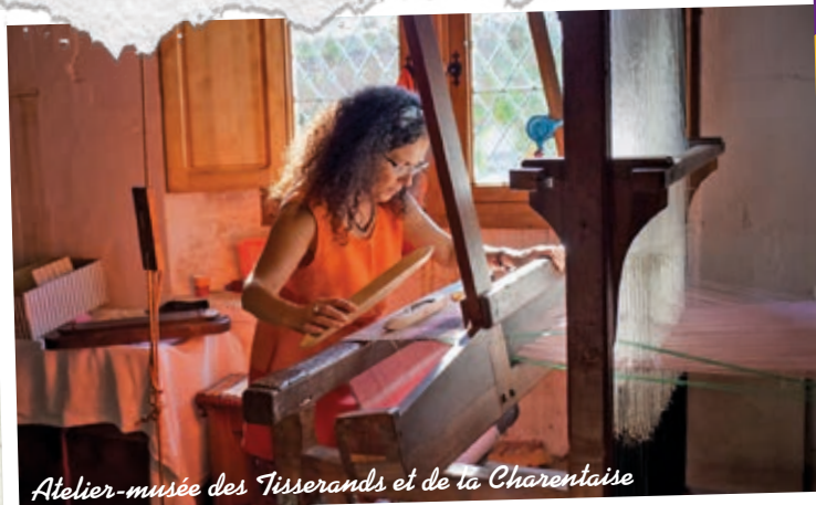
Atelier-musée des Tisserands et de la Charentaise

Since the 18th century, under the influence of the Rochefort arsenal, peasants have specialized in making ropes, to become weavers or falters to feed the naval and paper activities of the Charentes and the surrounding region of Angoulême.