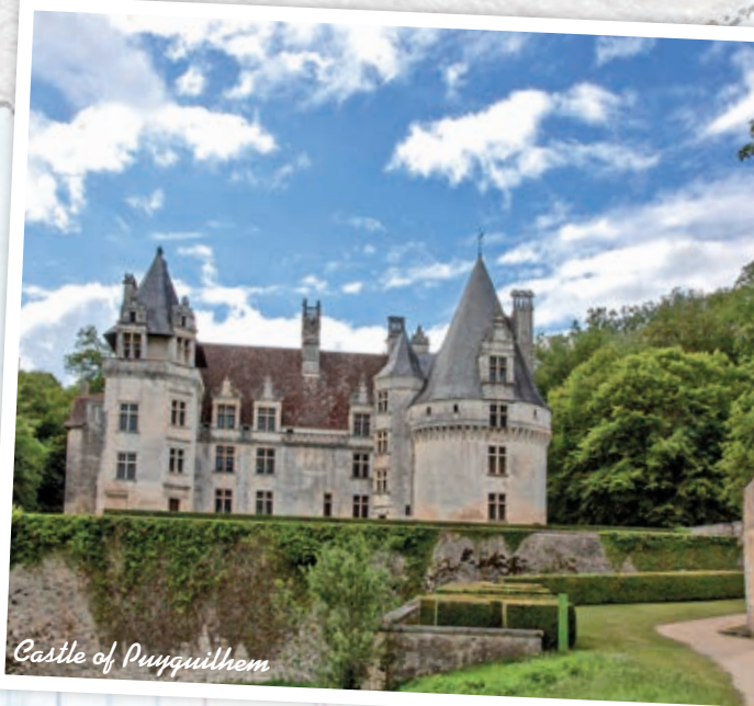
Castle of Puyguilhem

Today, the Festivillars association animates the site by organizing high-quality cultural events (events calendar on the website www.festivillars.com )