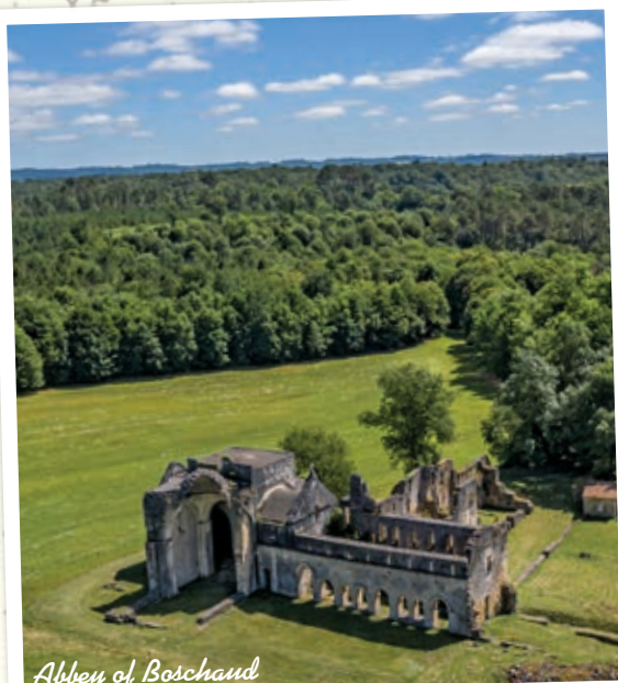
Abbey of Boschaud